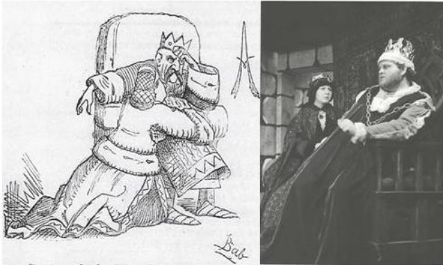
Rosencrantz and Guildenstern by W. S. Gilbert